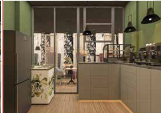
Turkish Kabab Uttara, Dhaka