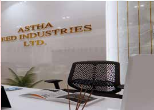
Astha Feed Ind. Ltd. Banani, Dhaka.