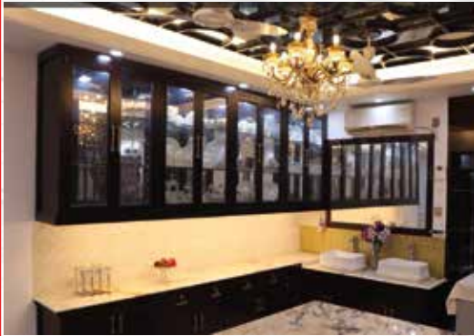
Home Interior Mirpur, Dhaka.