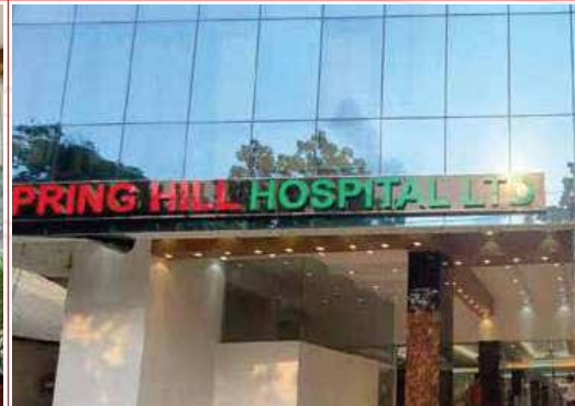
Spring Hill Hospital Ltd. Faridpur