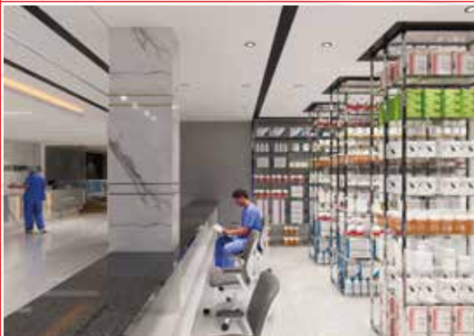
Island Hospital Ltd. Mirpur, Dhaka