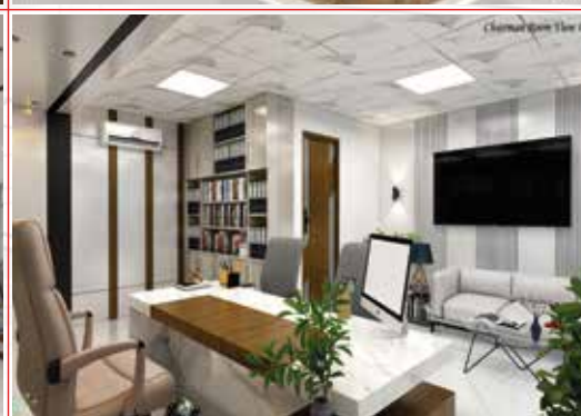
Globex Pharmaceuticals Ltd. Narayanganj