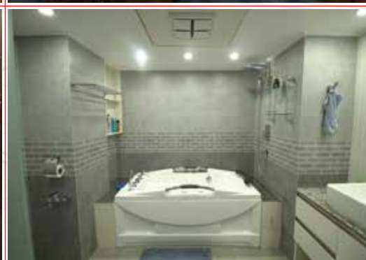
Duplex House Sirajganj, Rajshahi