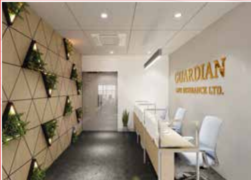
Globex Pharmaceuticals Ltd. Narayanganj