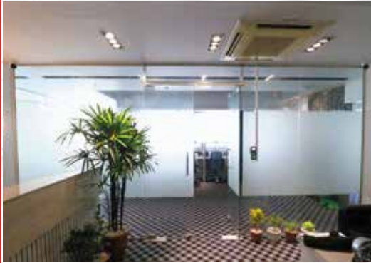
PalmPay Limited Uttara, Dhaka.